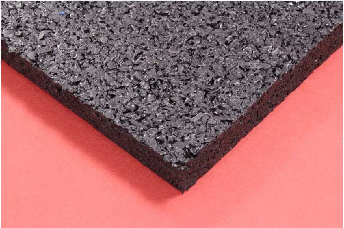
Side "B" of the product