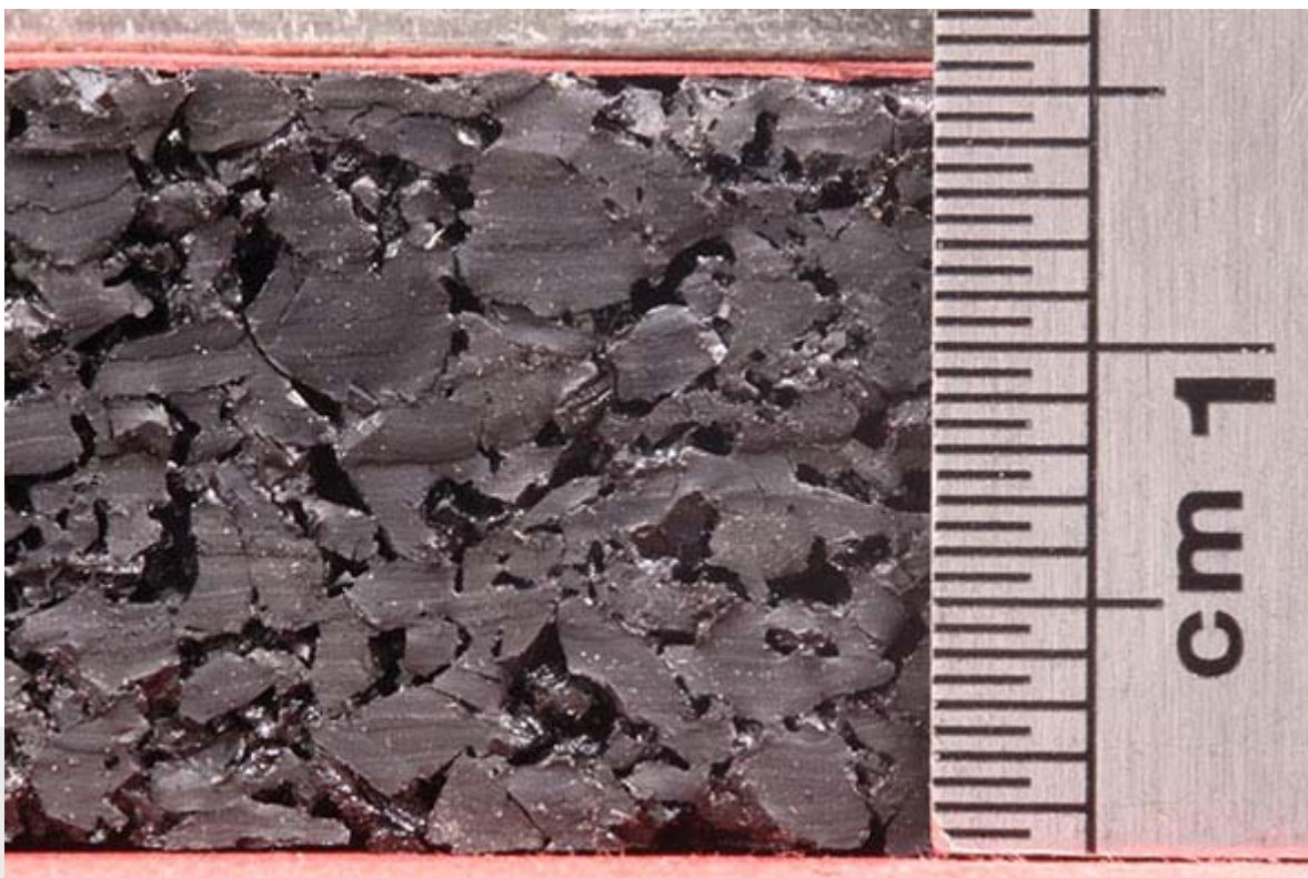
Cross section of the product