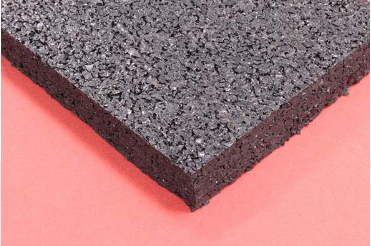
Side "A" of the product